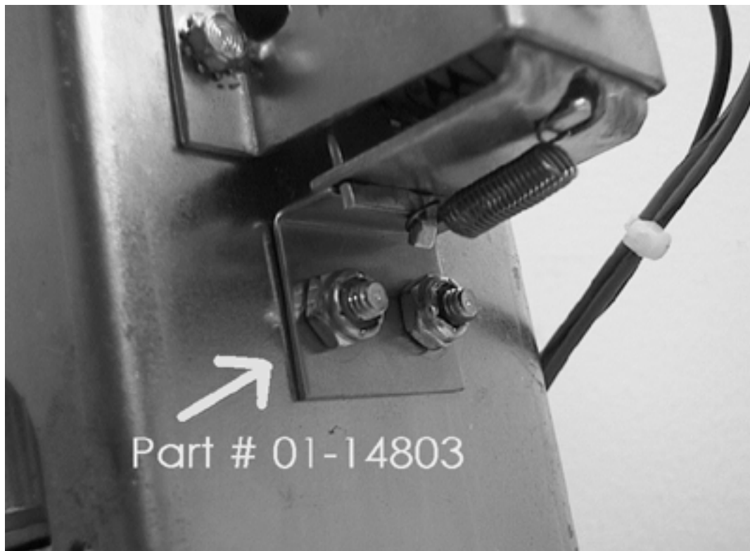
Part #01-14803 prevents the coil frame from bending.